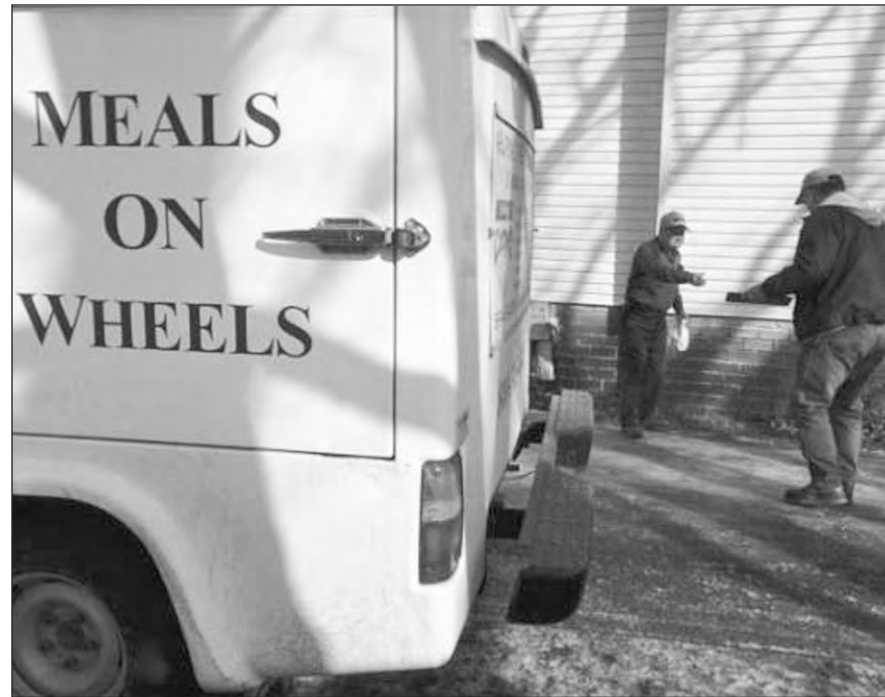
Meals are prepared in HAPCAP's state-of-the-art kitchen and delivered in Meals on Wheels trucks. Last year, 26,929 meals were delivered to participants' homes in Athens and Hocking counties and three congregate meal sites in Athens, Glouster and Logan. The kitchen also provides lunches for children in Head Start in Athens, Hocking and Perry counties.

In addition, the kitchen plays an integral role in the Empty Bowls fundraiser, supplying the soup, desserts and other necessary items for the annual event to fight hunger.