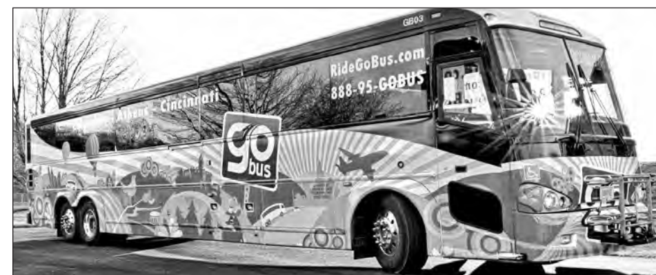
GoBus now travels in style, highlighted by its brand-new, bus-wrap designed by Kevin Morgan Studios in Athens.

The By Car program, is another brand-new venture for HAPCAP. It allows low-income residents of Hocking, Athens and Perry counties who do not have access to transportation to save money for the purchase of a vehicle. Upon entering the program, participants work with a counselor to open a savings account and establish a savings