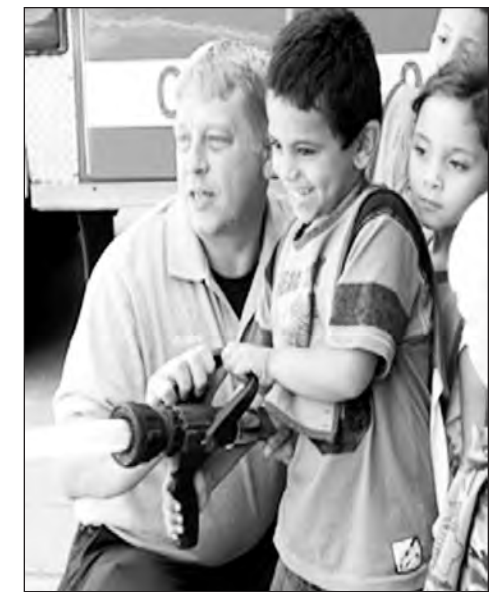
Left photo: Children at Head Start centers learn several physical and social skills through a variety of educational and fun processes. Right photo: Head Start also offers children a look into the everyday lives of professional people. A local firefighter instructs a youngster from Head Start on the proper method to use a hose.