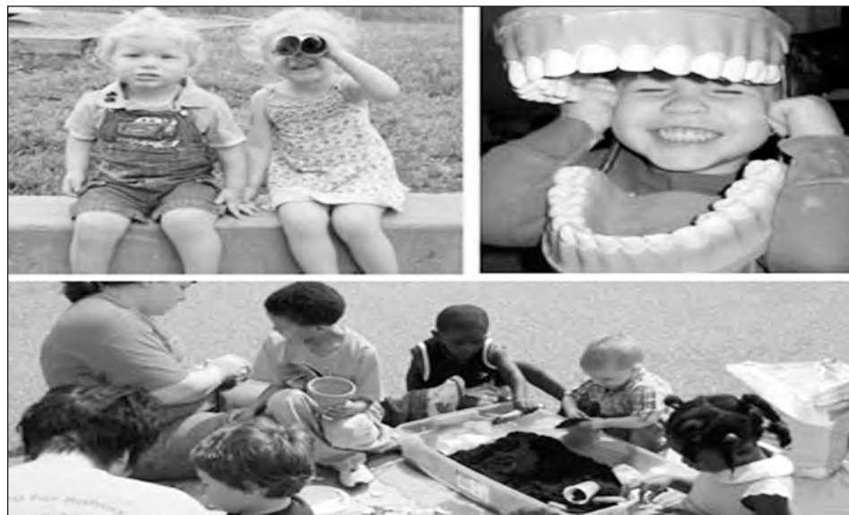
This is a collage of activities from Early Head Start.

Early Head Start is a federally funded home visitation program for pregnant women and children under age three. Head Start home visitors meet weekly with families who have children from birth to age three or are expecting a child. For expecting