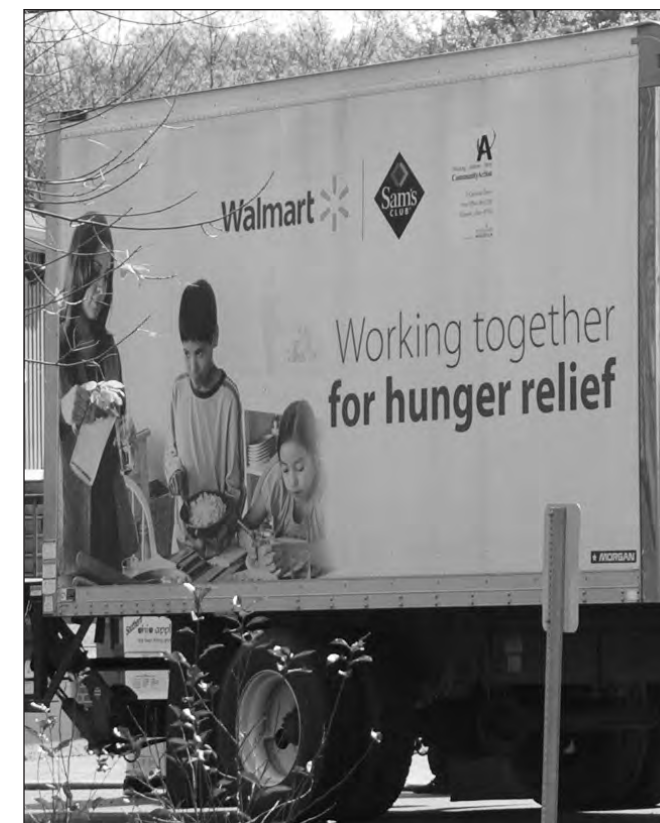
Southeastern Ohio Food Bank received an 18-foot refrigerated box truck from the Walmart Foundation through a grant administered by Feeding America. The truck enables the food bank to participate in food pick-ups from local Walmart and Kroger stores in the 10 counties it serves.

The BackPack program meets the needs of hungry children by providing them with nutritious and easy-to-prepare food to take home on weekends and school vacations when other resources are not available. In 2011, the food bank distributed 25,380 backpacks filled with vitamin-fortified food.