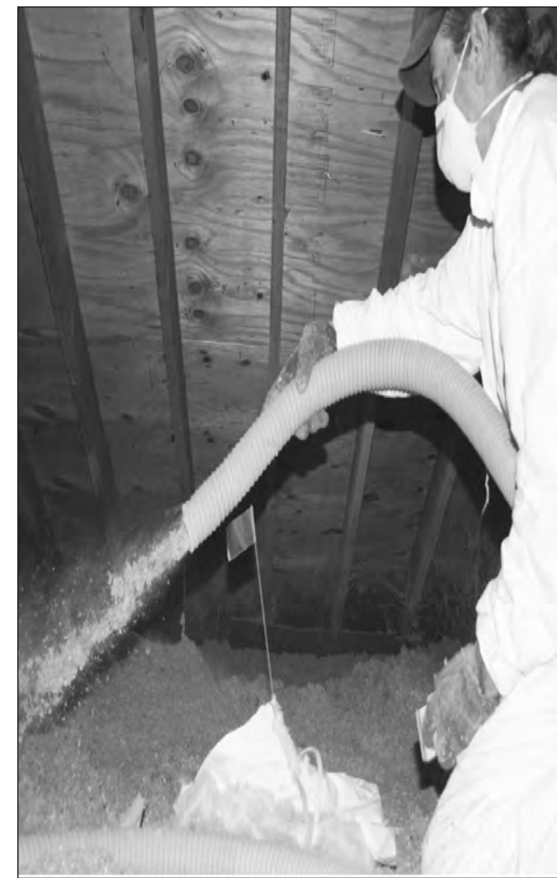
A HAPCAP employee blows insulation into an attic in Murray City. In 2011, 267 homes were weatherized in Murray City as part of a city-wide pilot program.