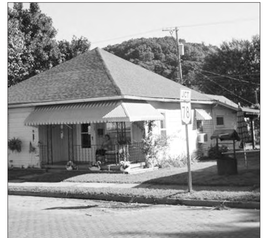
These are before (top) and after photos from a Community Housing Improvement Program (CHIP) project completed by Hocking Athens Perry Community Action in Nelsonville.