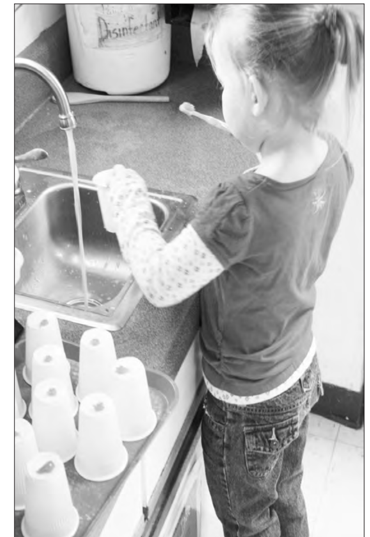
A young girl brushes her teeth after eating lunch at a Head Start center. Children receive lunch daily as part of their academic, social and nutritional environment.