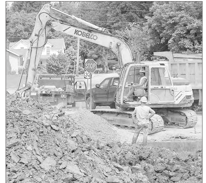
A sewer upgrade project in Athens County is one example of infrastructure improvements made possible through the Community Development Block Grant.

Examples of eligible CDBG projects include street and sidewalk improvements, water and sewer upgrades, and parks and recreational facilities. The funds can also be used to upgrade community buildings such as museums, senior centers, and fire stations.