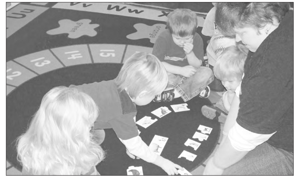
Children at Head Start centers learn a myriad of skills through many educational and fun processes.

In 2010, 1,220 children were served in Athens, Hocking and Perry counties through Head Start and Early Head Start. Each child received a medical examination and health and educational screenings. In the three counties combined, 2,481 people volunteered their time for the program.