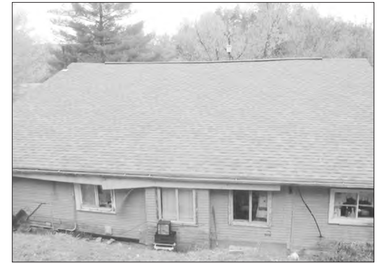
Families in Athens, Hocking and Perry counties utilize the services of HAPCAP's Housing and Community Development Division to improve their homes and properties. Top photos: An old worn roof (left) is replaced at a residence on Madison Street in Nelsonville. Bottom photos: A dilapidated wooden retaining wall in New Lexington is replaced by a masonry one.