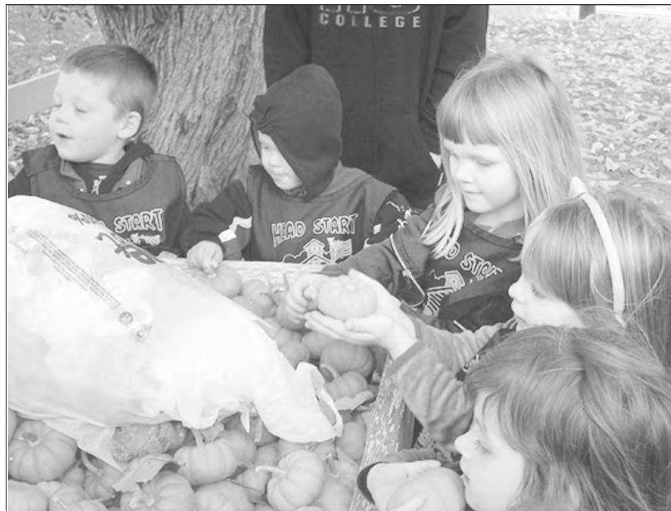
Children at Head Start enjoy a day in the pumpkin patch. Many activities are planned for Head Start students to allow them to experience different aspects of life.

228 W Jefferson St. New Lexington, OH 43764 Phone: 740-342-1333 866-342-1333 Fax: 740-342-1165 nlhs@hapcap.org