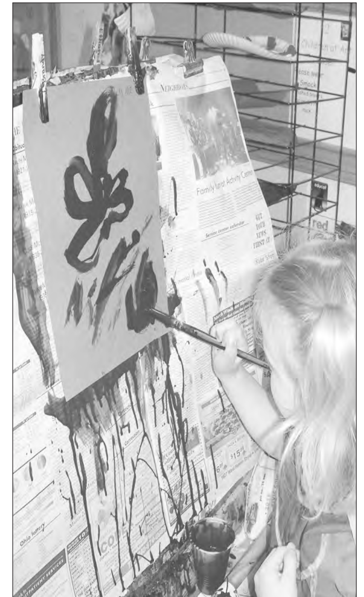
A young girl paints a beautiful creation during a Head Start activity.