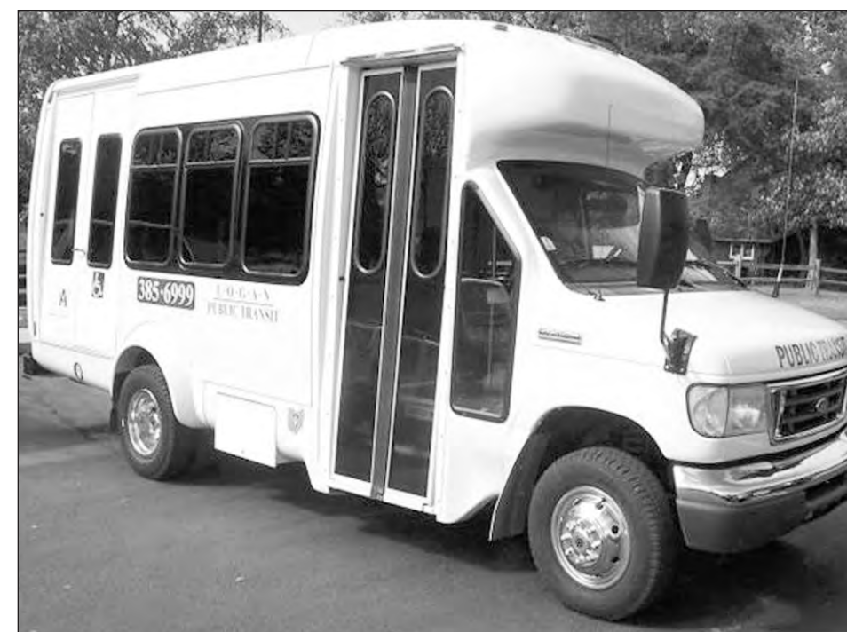
Logan Public Transit increased its ridership by 2,500 passengers in 2010, a 27 percent increase from the previous year, and the trend is continuing in 2011. Logan Public Transit has four vans and one bus for transportation purposes. All of the vehicles are handicapped accessible.

The HAPCAP Scholarship Committee, made up of employees of the agency, conducts fundraising events year-round to help fund the scholarships. Since 1999, the agency has raised more than $48,000 — mostly from employee donations — to help provide financial assistance to residents. The